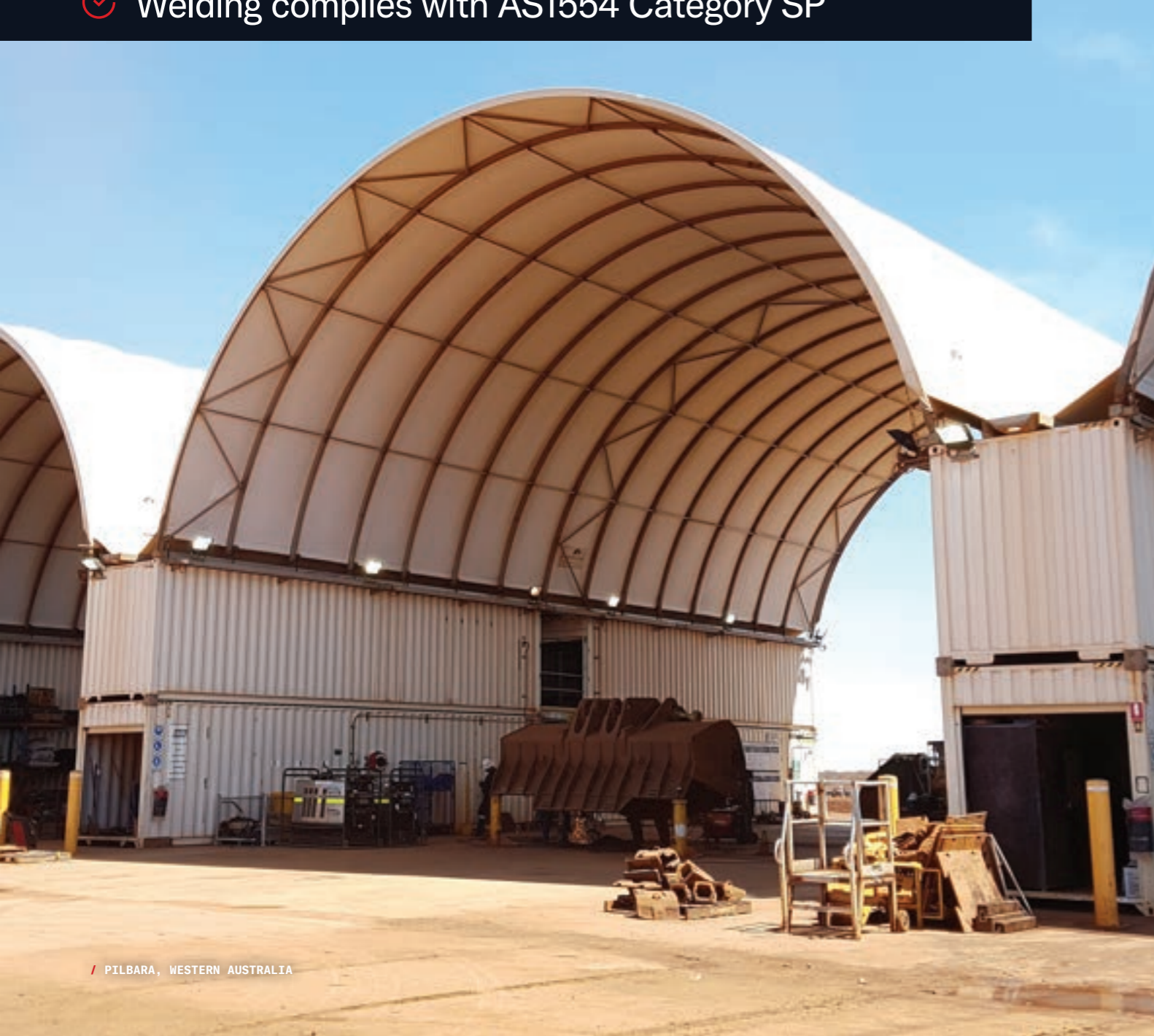
/ PILBARA, WESTERN AUSTRALIA

✔ Welding complies with AS1554 Category SP