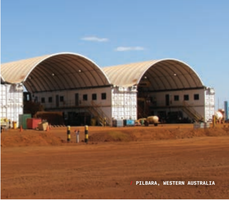
/ PILBARA, WESTERN AUSTRALIA