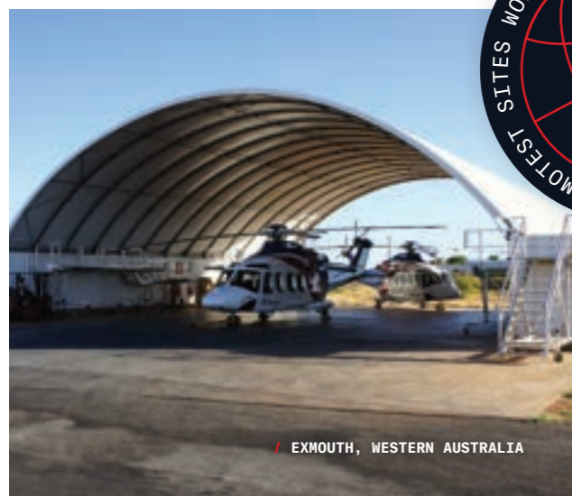
/ EXMOUTH, WESTERN AUSTRALIA