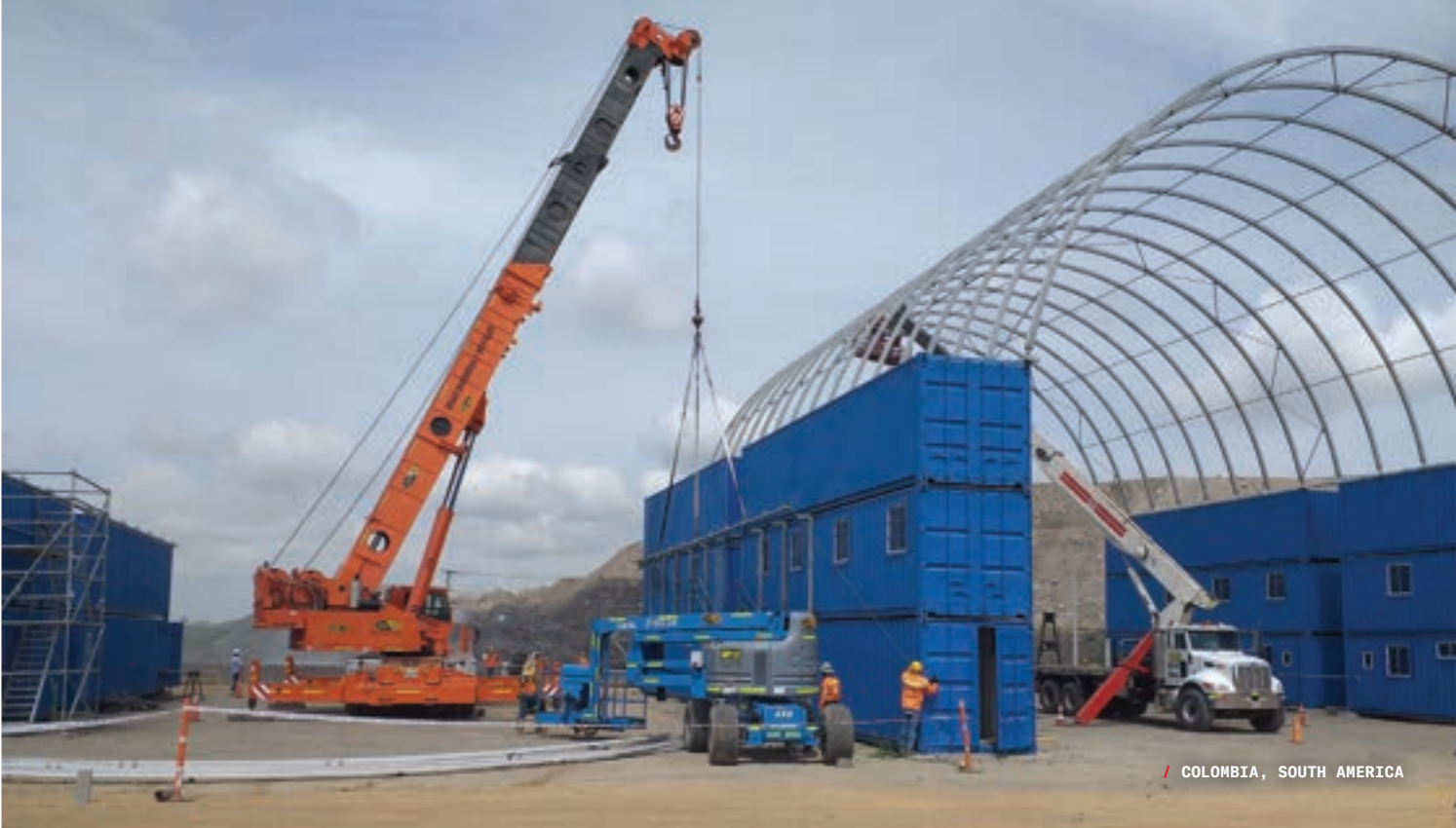
/ COLOMBIA, SOUTH AMERICA